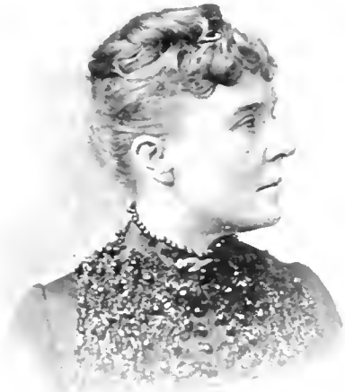
ROSE ELIZABETH CLEVELAND.

CLEVELAND, Miss Rose Elizabeth, author, born in Fayetteville, N. Y., in 1846, and